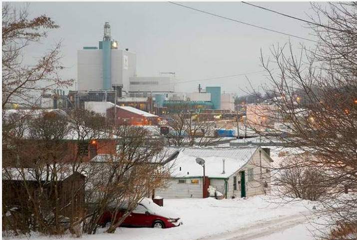
RESISTANCE TO CHANGE